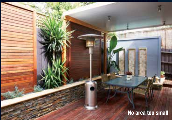
No area too small