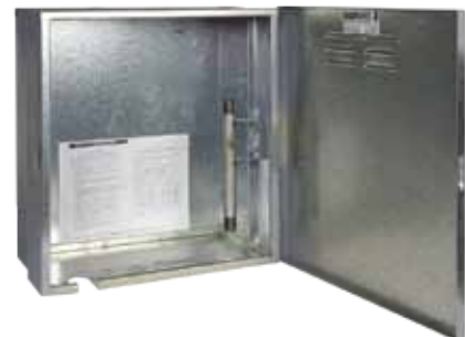
DOMESTIC GAS METER BOX