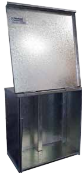
DOMESTIC ELECTRIC METER BOX